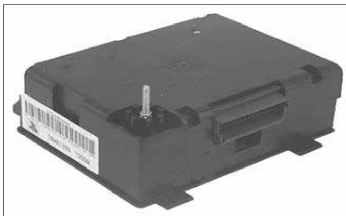
Figure 1 – Air Conditioner Programmer

Original GM Model Number 16218401 Original GM Service Number 16227376 Updated GM Service Number 19151964 Original Delco Part Number 15-72209 Current Delco Part Number 15-73768