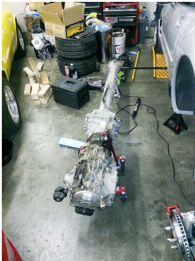
My Z06 six speed drive line!!

For those that watched the 24 hours of Le Mans Saturday the first driver fatality at the high-speed endurance event since 1997, happened at just 10 minutes of after the start of the race, Danish driver Allan Simonsen who drove for Aston Martin in car No. 95 .The car spun at high speed and skidded into the barrier at the Tertre Rouge corner where speeds reach up to 105 mph.